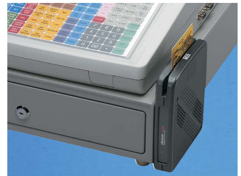
DataTran™ Integrated Credit Option