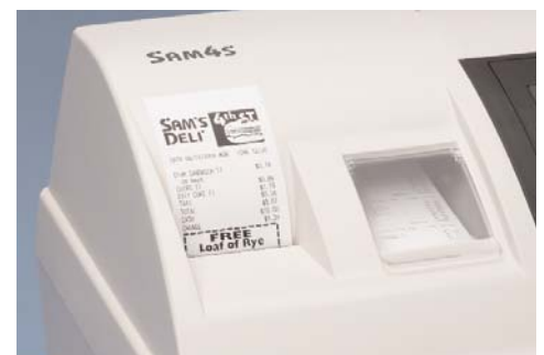
Quick and Easy Drop and Print Paper Loading