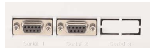
Two Standard RS-232C Ports