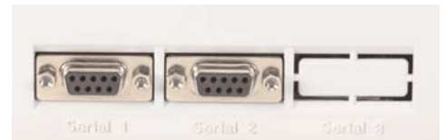
Two Standard RS-232C Ports