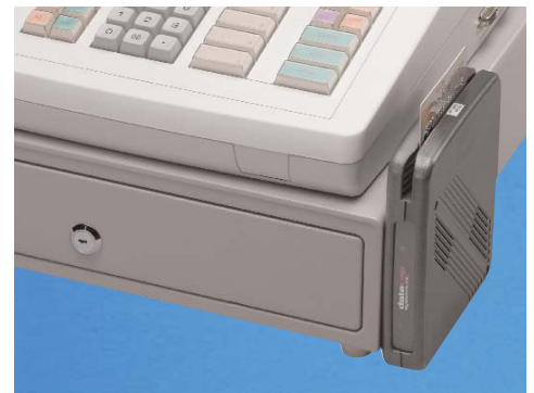
DataTran™ Integrated Credit Option