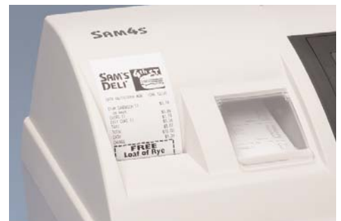
Quick and Easy Drop and Print Paper Loading